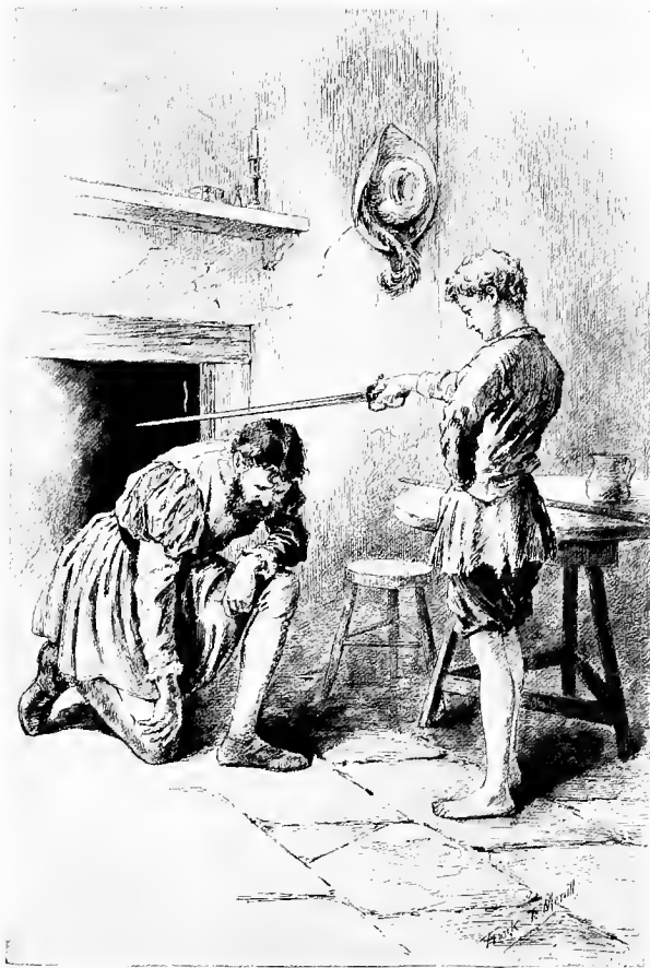
"RISE, SIR MILES HENDON, KNIGHT"